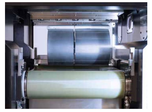
Long load length for high output